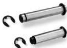
Art.-Nr. 1126040 Art.-Nr. 1126060

Stifte passend für/Pins suitable for STAR - CHUCK LEVER