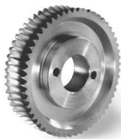
Worm gear from another machine typ